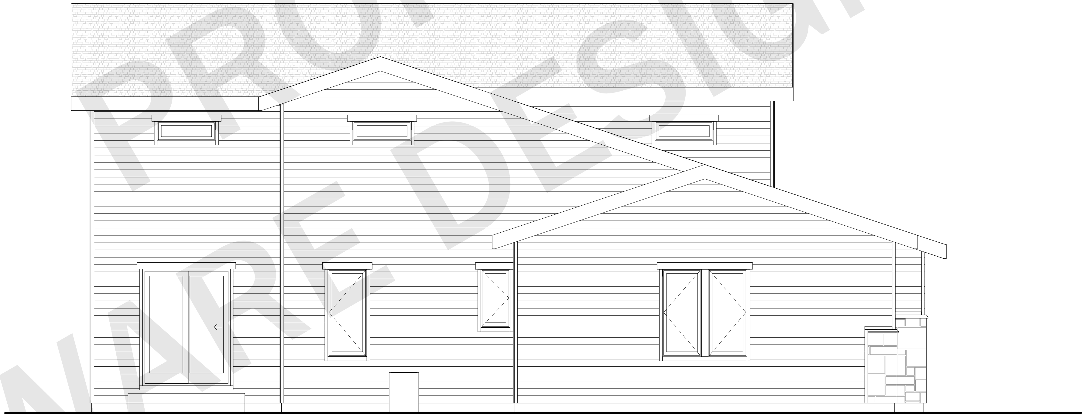
2 LEFT ELEVATION SCALE: 1/4" = 1'-0"