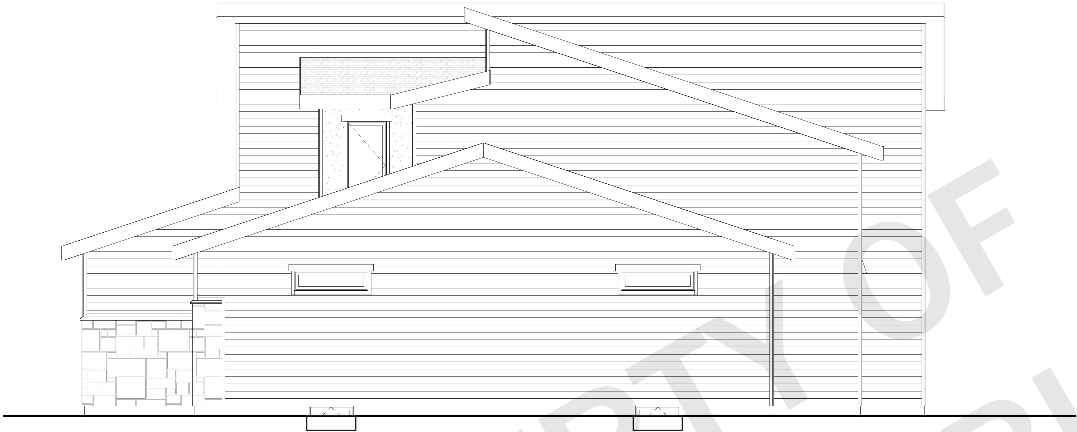
1 RIGHT ELEVATION SCALE: 1/4" = 1'-0"